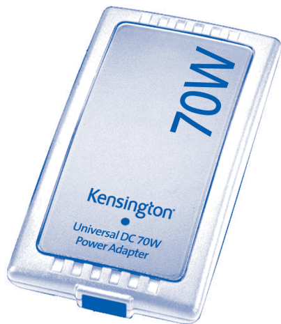
70 Watt DC Power Adapter for Apple Notebook • 1